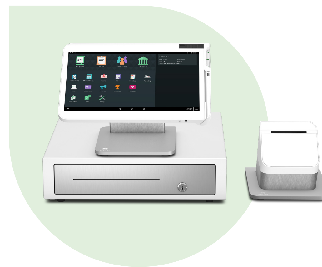
Clover Station Solo

Clover Flex makes it easy for your merchants to serve their customers from anywhere—in line, at the table, or in the field. Merchants can accept payments, track sales and manage business from a simple, hand-held POS system.