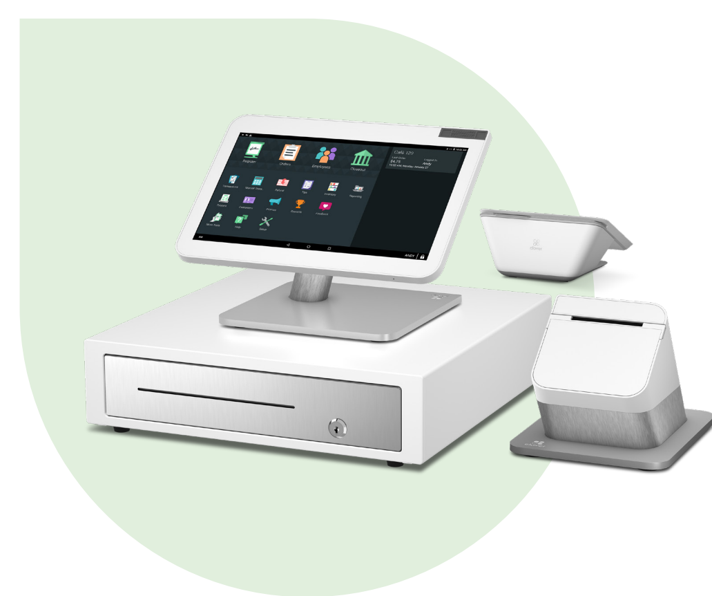
Clover Station Duo

Accept payments and run your business with a flexible, all-in-one point-of-sale system. Station Solo offers the power you need to process customer payments, print receipts, track sales transactions and run Clover's software to manage your business.